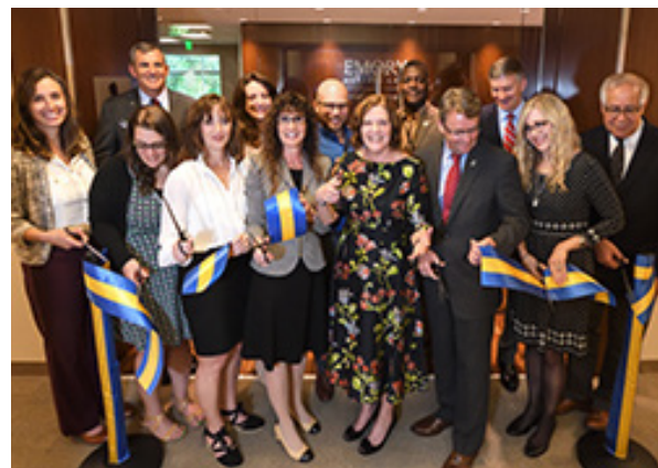
Executives from WWP, Emory University, Emory Healthcare and Emory Healthcare Veterans Program were present at the ribbon cutting of Wounded Warrior Project® Brain Health Suite on May 20th.