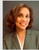
Nadja West Lieutenant General, USA (ret.)